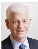
MARIO J. GABELLI, CFA Chief Executive Officer GAMCO Investors, Inc.